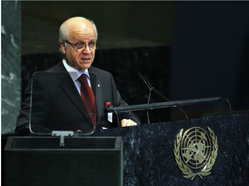
Algeria's Foreign Minister Mourad Medelci addresses the 67th United Nations General Assembly at the U.N. Headquarters in New York 29/09/2012.